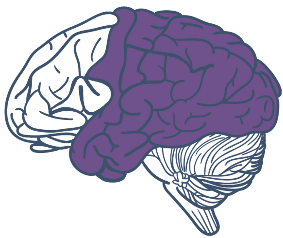
Alt Text: Illustration of the human brain with the recognition regions highlighted in purple.