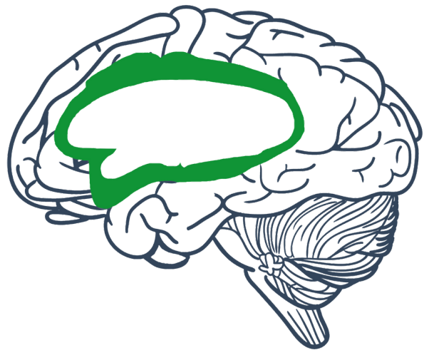
Alt Text: Illustration of the human brain with the affective regions outlined in green.